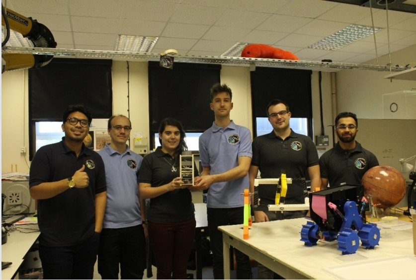
Figure 1. The Land 3U team